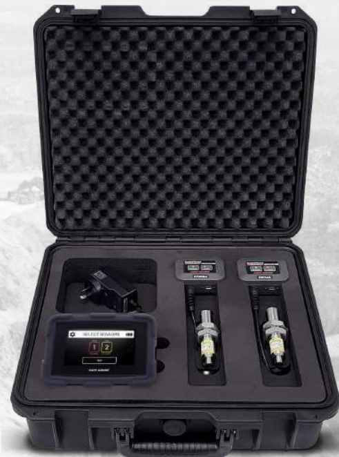
SafeTest TM2 Channel Kit