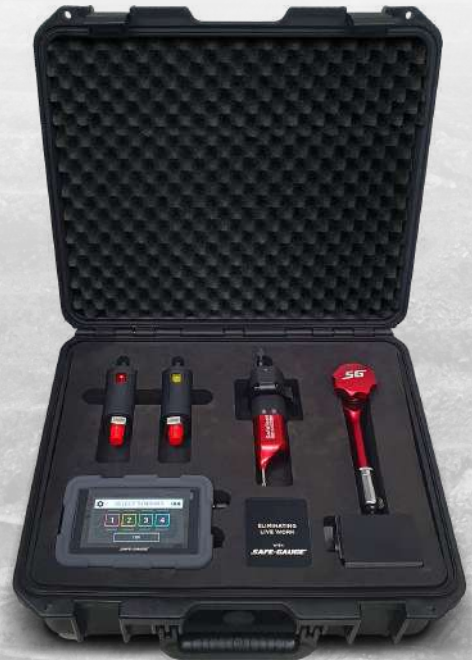
SafeTest Field Service Kit, also featuring the SafeTest Pressure Transducer (PT Series)

Custom kits and accessories are available on request.