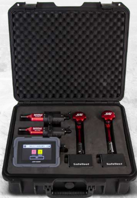
SafeTest DI2 Kit